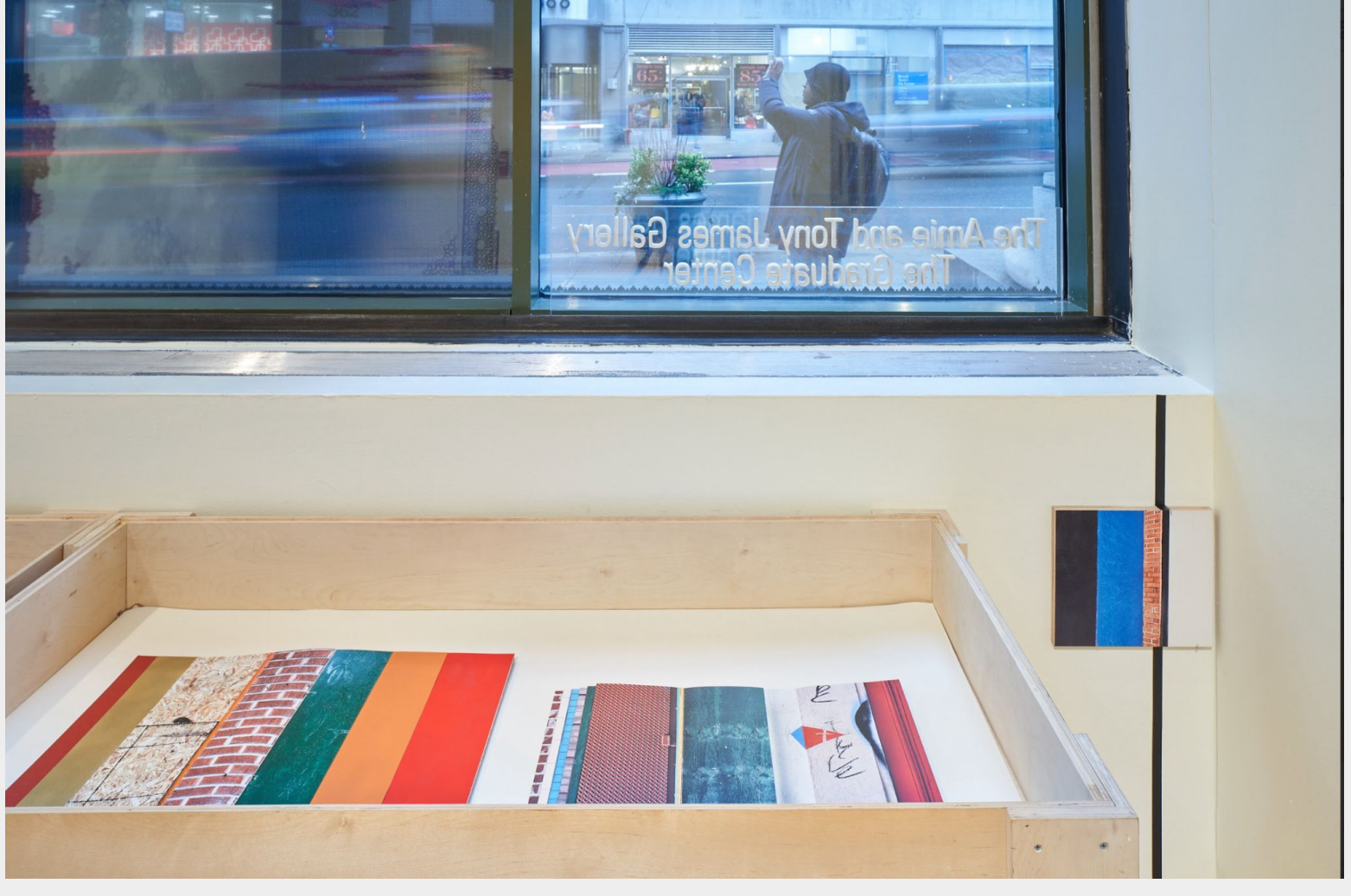
Rhea Karam vitrine and wall installation