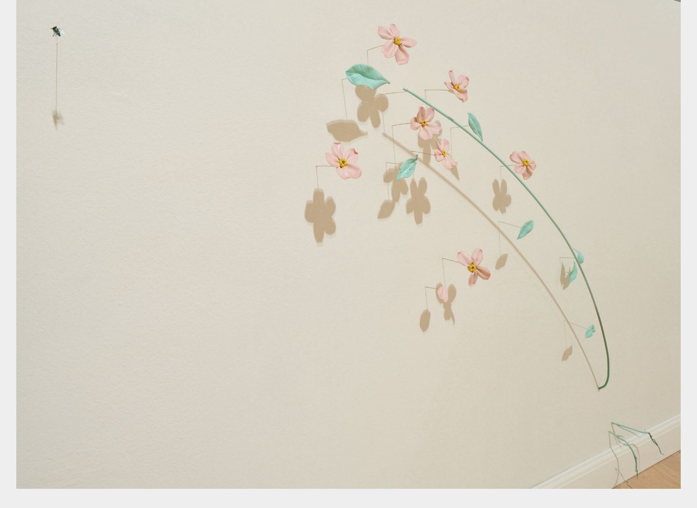
Detail of Langdon Graves